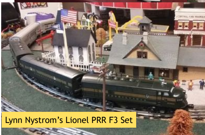
Lynn Nystrom's Lionel PRR F3 Set