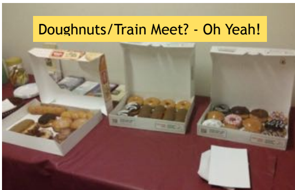
Doughnuts/Train Meet? - Oh Yeah!